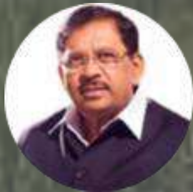
Dr G Parameshwara Chancellor SSAHE